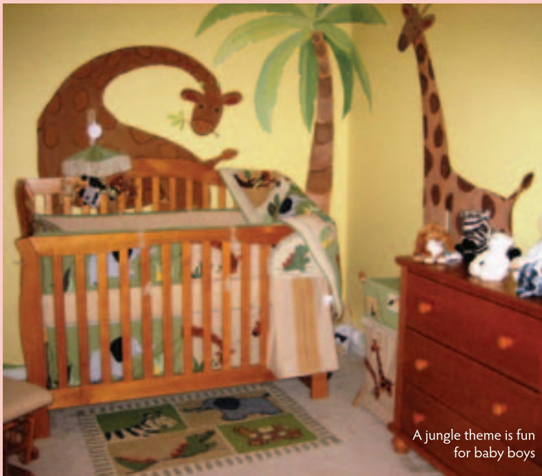
A jungle theme is fun for baby boys