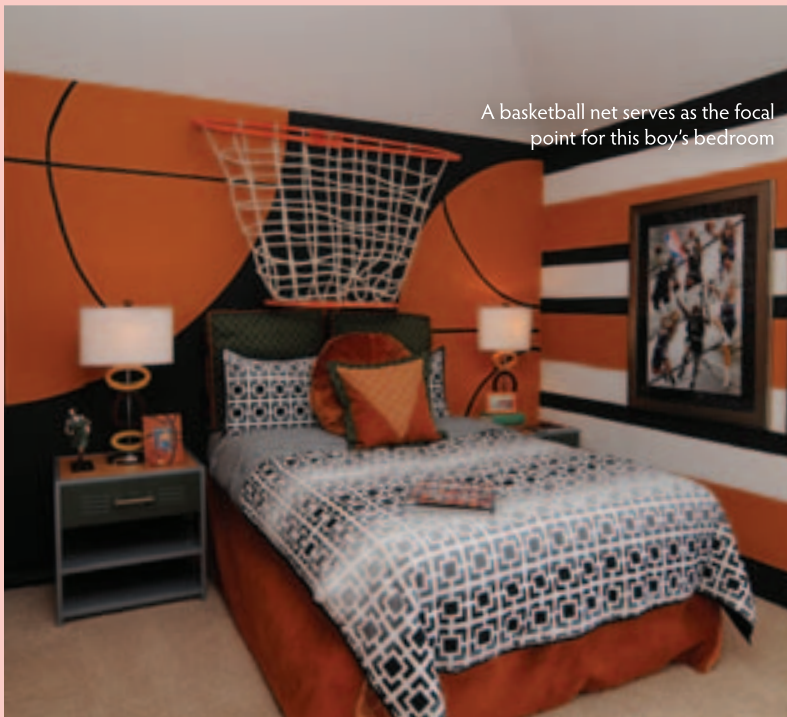
A basketball net serves as the focal point for this boy's bedroom