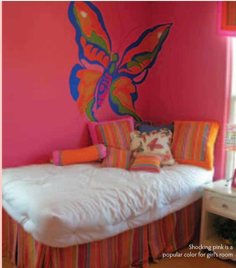
Shocking pink is a popular color for girl's room

rocking chairs are a nice addition to a little child's room, as are other functional chairs. "Choose different pieces that are versatile," advises Chaisom. "Ones that they can grow into and that they aren't stuck with after a certain age, or ones that can be moved to another room later on."