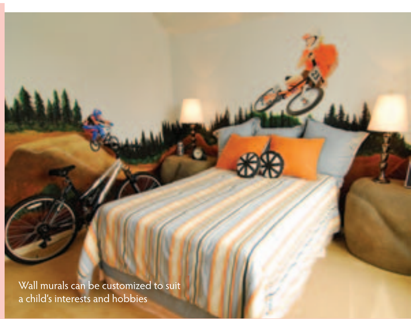
Wall murals can be customized to suit a child's interests and hobbies