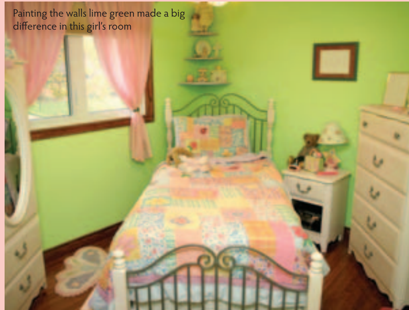
Painting the walls lime green made a big difference in this girl's room

D o you find yourself wondering how you can gain more time to relax - to take a break from keeping your kids constantly busy and entertained? Decorating your child's room into their personal sanctuary just might do the trick. From choosing the proper theme to installing the last light, Sugar Land area designers and mothers offer decorating tips and ideas to create the best setting, one that will help keep your child occupied in their room while you enjoy some peace and quiet.