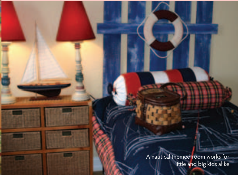
A nautical themed room works for little and big kids alike