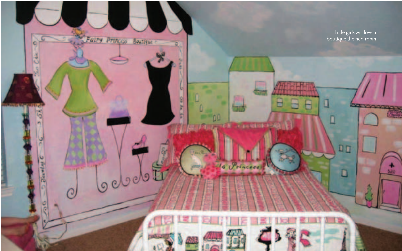
Little girls will love a boutique themed room