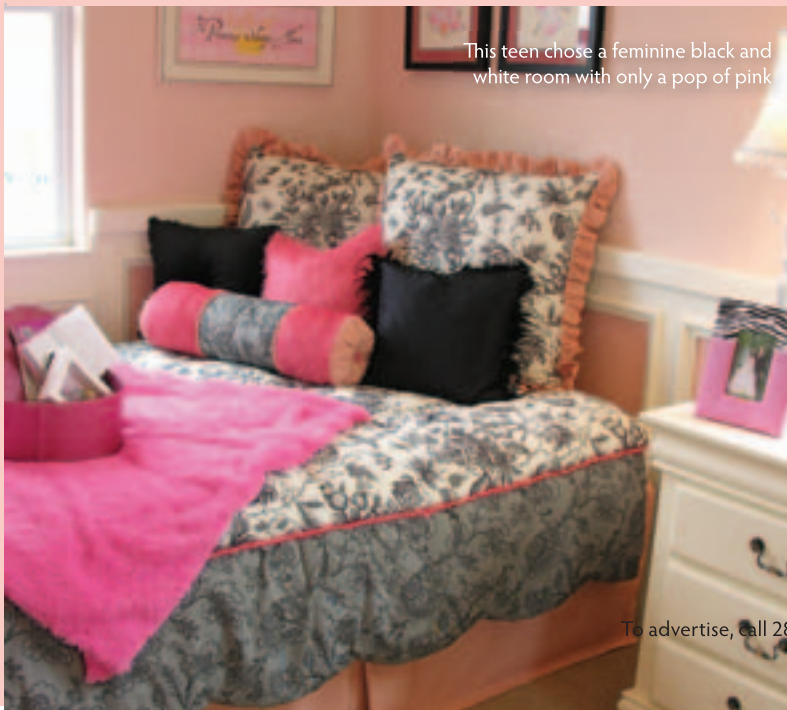
This teen chose a feminine black and white room with only a pop of pink